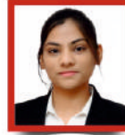
LOVELY RAWAT COFFEE DAY BEVERAGES PACKAGE : 8.00 LPA