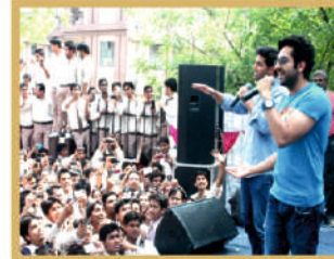
Ayushmann Khurrana @ I.T.S