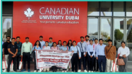
Overseas Tour @ Dubai