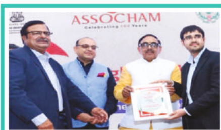
Excellence in Promoting Industry Academia Interface North-2020 by ASSOCHAM