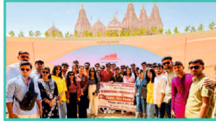
Overseas Tour @ Abu Dhabi & Sharjah