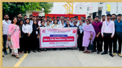
Visit to Coca Cola