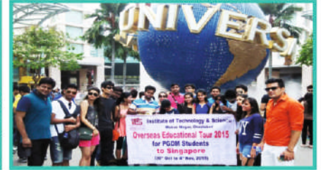
Overseas Tour @ Singapore