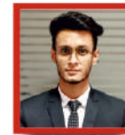
ANSUL TARAGI Ashoka PACKAGE : 6.50 LPA