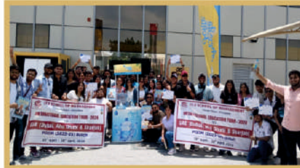
Visit to RAJYOG Water Bottling LLC, Dubai