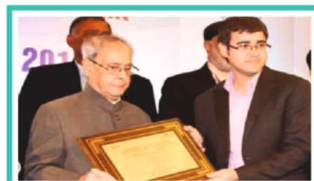
Most Preferred UG/PG Institute of India Award-2019 ASSOCHAM by Late Dr. Pranab Mukherjee