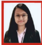
RITIKA PRECISION for medicine PACKAGE : 6.30 LPA