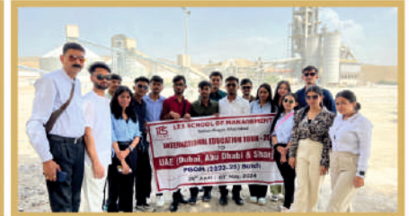
Visit to JK Cement, Dubai